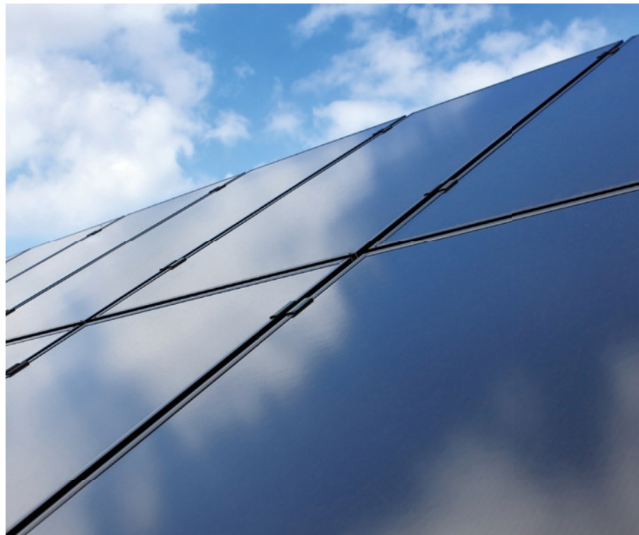
Thin film photovoltaics